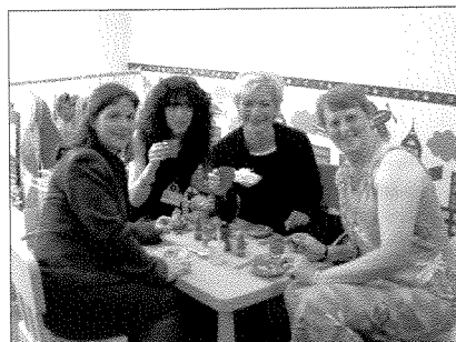
The official opening on 27 June 2003

West Hertfordshire Hospitals NHS Trust have appointed TLC (Tender Loving Childcare) Ltd as their childcare provider who are able to offer a flexible childcare service to NHS staff who need it.